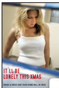
A6 FLYER (front & back)